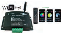
LN-CON-WIFI-3CH-XV WiFi controller for RGB, c/w RF remote 12/24VDC